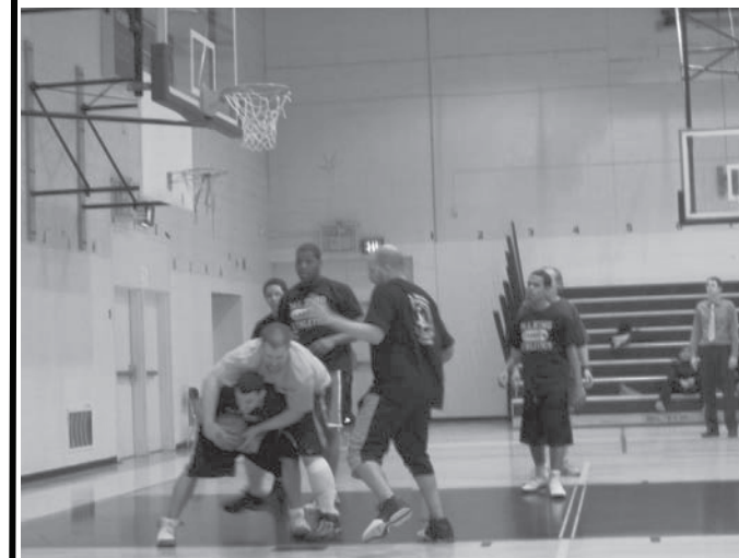
Foul Play? See page 5 for full coverage of the Senior Vs. Teacher Basketball Game

Junior Arafath Hussein said that the new uniform policy would, "motivate [students] to wear the uniform the rest of the week."