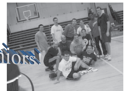
Teachers enjoying a break after a grueling game