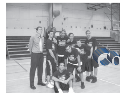
A winning pose for the seniors

Money raised from the game is going towards helping out in Darfur (see page 4 for more information).